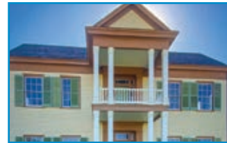
The John Ruckman House