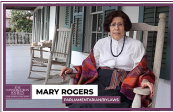
Mary Rogers Yturri-Edmunds Tour